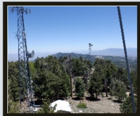
View from the top of the tower. 5-22-20