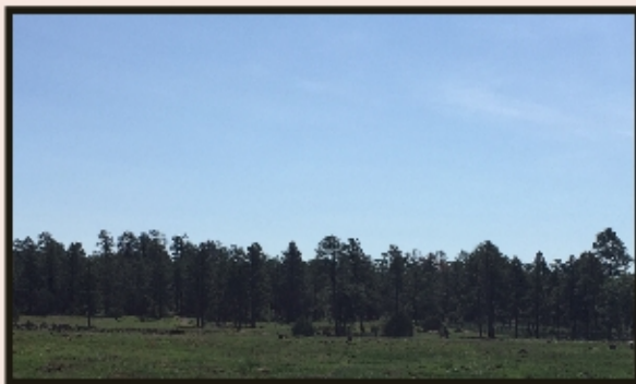
Mountain Meadows Park

Heartfelt thanks to all of you who attended the White Mountain Hamfest. We look forward to seeing you again next year!