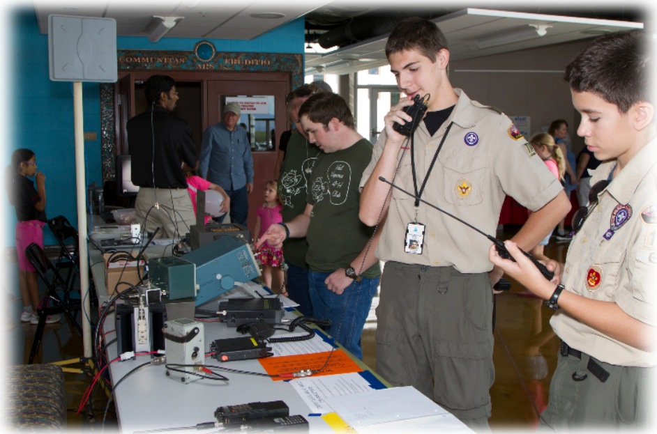
KG7EXA and KG7IQO working the WN7BSA booth at the ARISS Contact STEM Event.

The following article and photos were intended to be in the September Newsletter but were left out by mistake.