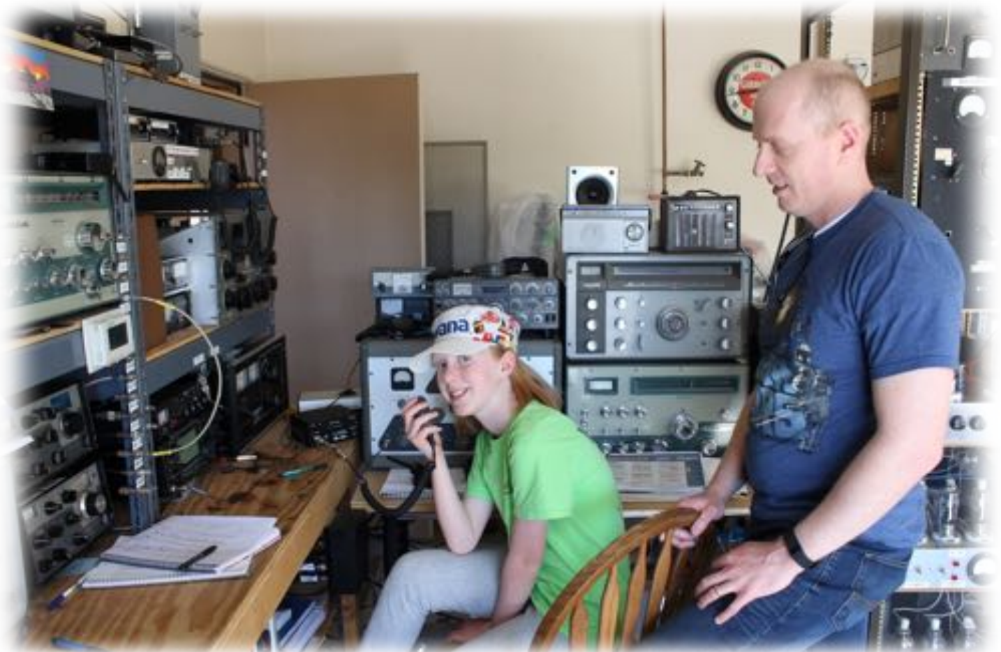
KG7ZXB and KG7WVH