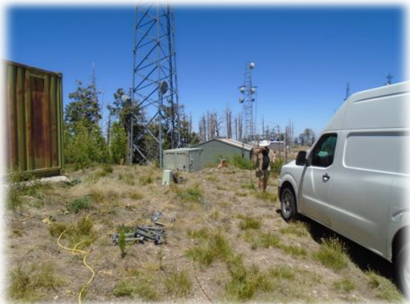
Mt Lemmon tower cleanup

Please contact Dave, N7AM, if you are interested.