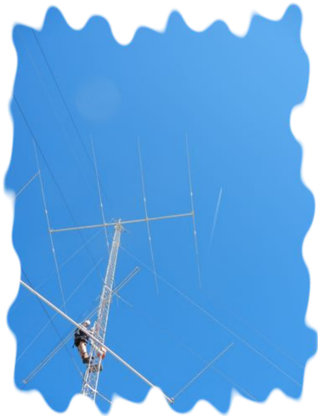
Installing the new home-brew 15m bi-directional beam at 12-Toes, AZ