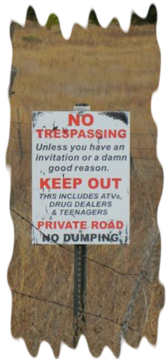
Hmmm, SOTA is not listed. Should I continue?