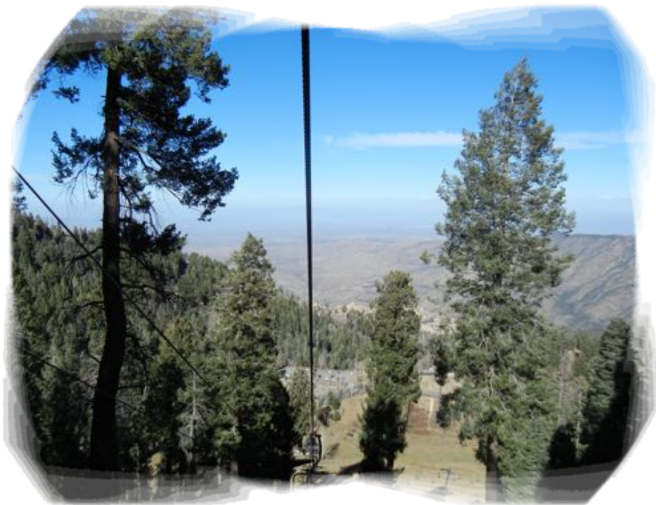
View while operating Skylift portable KY7K/p