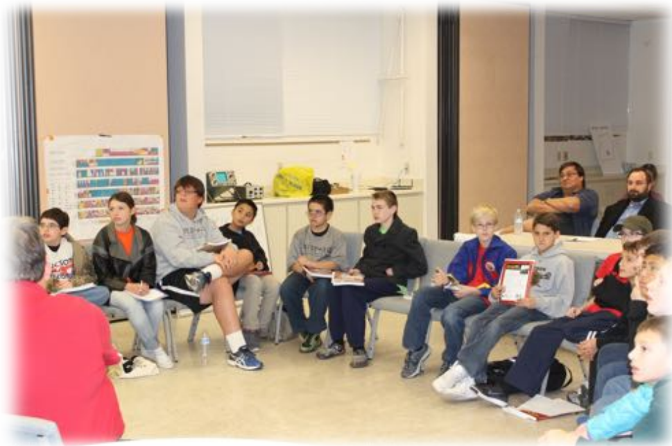
Classes at WN7BSA