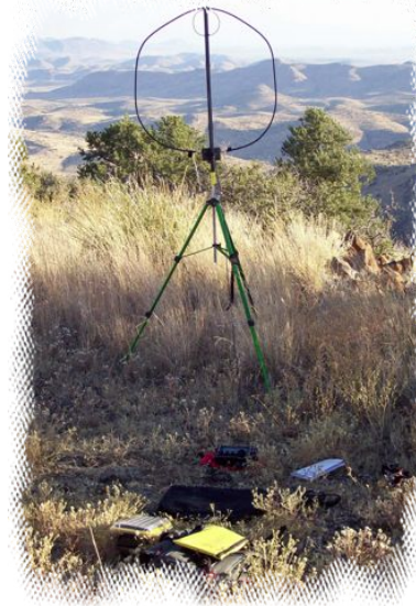
Guthrie Peak, W7A/AE-054

Equipment used: Elecraft KX3 Alexloop antenna 3.3ah SLA battery Yaesu VX8r HT