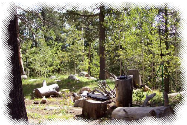
Webb Peak, W7A/AE-010

Luckily Ben, N7XL, read about my plans and informed me that Mt. Graham was completely closed to all access and that Webb and Heliograph both had locked gates about two miles from the summit. No problem, I'll just have to hike