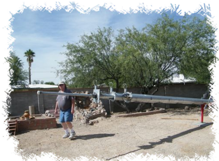
Tower in the fold-over position.