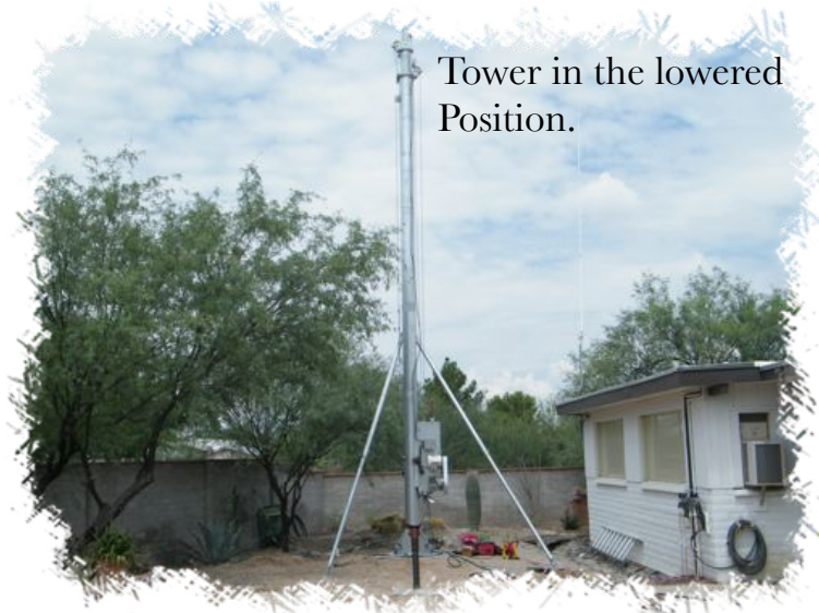
Tower in the lowered Position.